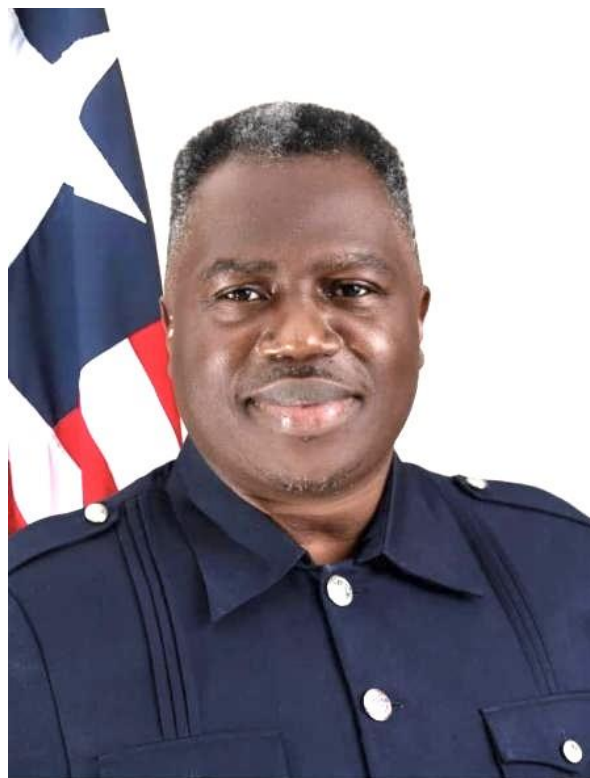
Vice President Hon. Jeremiah Kpan Koung

A day after the report from the Senate and in accordance with his promise to execute an audit of the past government, President Boakai has asked the General Auditing Commission to audit the Central Bank of Liberia, the National Security Agency and the presidential elite force Executive Protection Service. The audit according to the government will cover the period from 2018-2023. The Audit Commission is expected to report in three months.