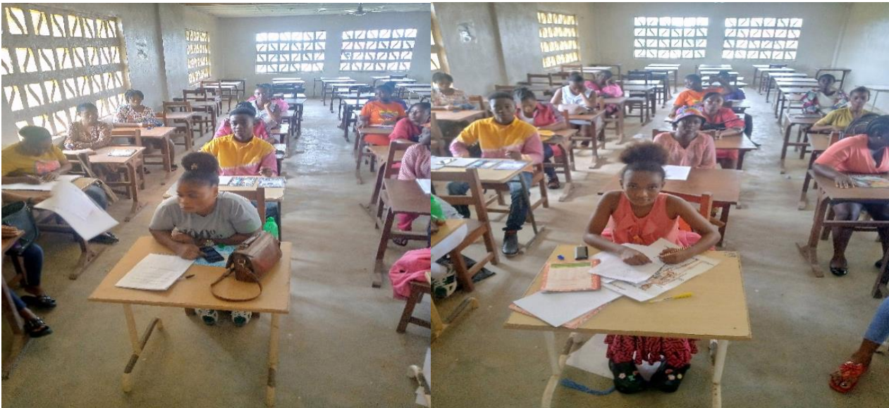
Stora lektionssalen på University College

The profile of the gender composition of the students shows that our student body is dominated by females.