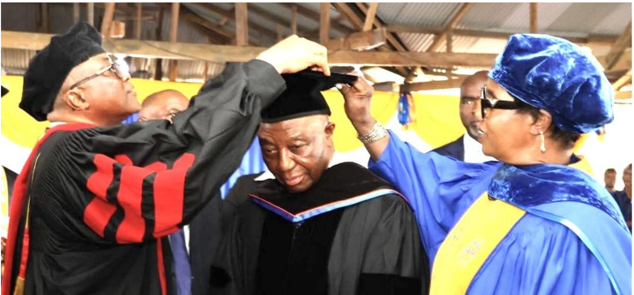
On January 31, 2024, the United Methodist University confers Honorary Doctorate Degree on President Boakai.

Med ditt stöd kan Liberia Dujar Association bidra till att skapa en framtid för Liberias barn och ungdomar genom utbildning.