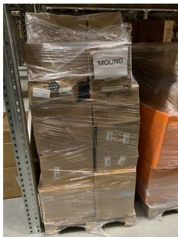
En av de fem pallarna.

Men hur får man grejerna till Liberia? Vi har tidigare skickat stora containrar och vet hur det går till, så vi har nu tittat på en 20 fots container. Den rymmer våra pallar flera gånger om, så det blir i så fall plats för mer, t.ex. skolmöbler, ifall vi kan hitta lite sånt. Men containern kostar 23 000 kr, och det finns inga pengar avsatta för detta i vår redan ansträngda budget.