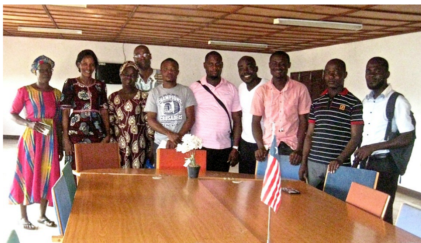
Några av lärarna på Grassfieldsskolan

In conclusion, it is our hope that some individuals, companies and or humanitarian organizations comes to the aid in making Liberia Dujar High School second to none.